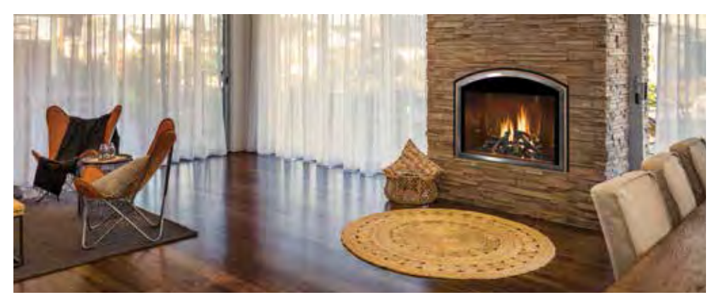
Mendota fireplaces and fireplace inserts are designed to create a warm and welcoming respite from the rigors of the day. A place of comfort, where the fireplace and the memories created around it are both meant to last a lifetime.