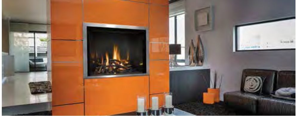
Two rooms with two completely different styles, perfectly finished with one fireplace collection. That's the true beauty of Mendota Décor fireplaces and fireplace inserts.