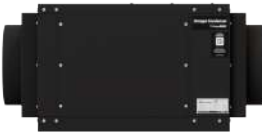
Ducted Omega Condenser