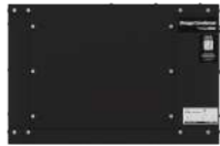
Ductless Omega Condenser