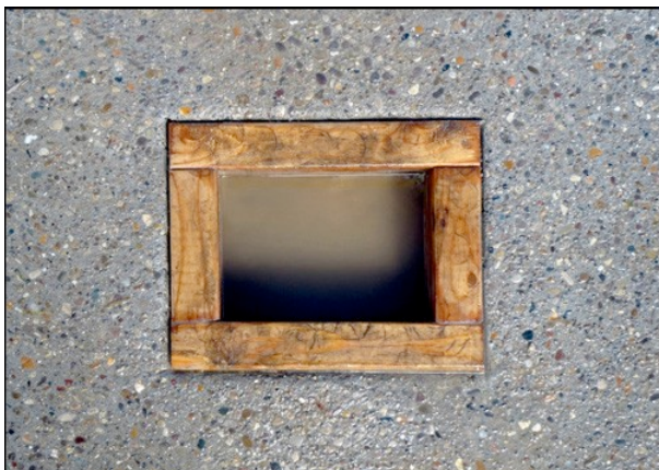
Method 3 2x4 Block Out for installation after the flatwork has been poured and cured

This method is also ideal for installing our plaques into an asphalt drive.