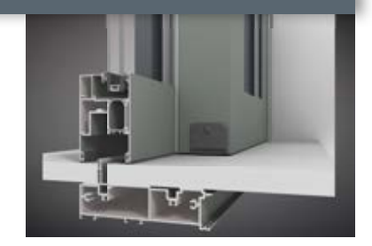
Zero Threshold CP155 model shown with 2-track system Available for 1-, 2-, 3- and 4-track systems