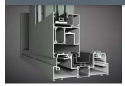
Standard Threshold CP155 model shown with 2-track system (Standard) Available for 1-, 2-, 3- and 4-track systems