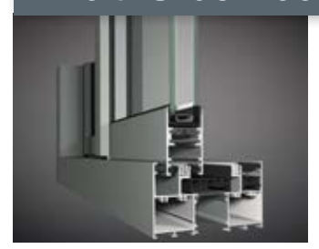
Shown with a 2-track system