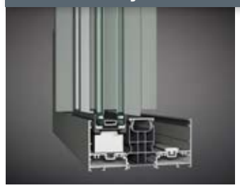
Shown with a 2-track system