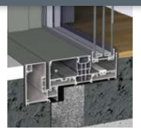
Shown with concealed sill with water management system