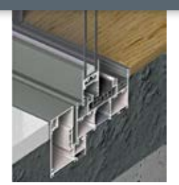
Shown with concealed sill