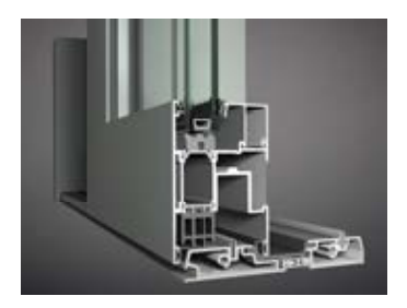
Flat Threshold CP155 model shown with 2-track system Available for non-pocketing 2-track systems