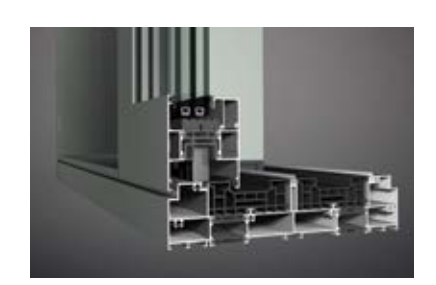
MP model shown with a 3-track system