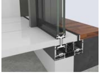
Floor in Zero Threshold