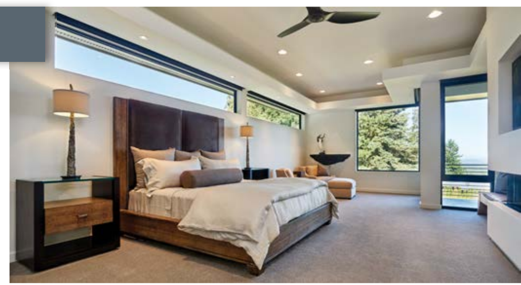
Architect: Barclay Home Design

See kolbewindows.com/solutions/energy-efficiency for energy performance data and climate zone maps