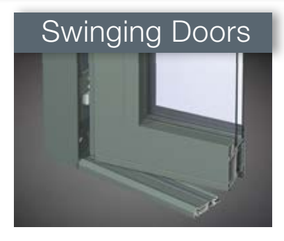
Inswing shown with barrel hinge option