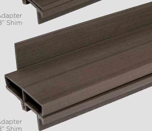
Direct Glaze Adapter with 3/8" Shim