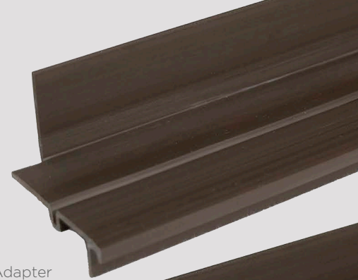
Direct Glaze Adapter

The Direct Glaze Sidelite Adapter can provide your exterior doors with custom glass glazing options, paired with minimum framing details to create the perfect complement to today's modern entry door aesthetics. All components, including height adjusting shims and a low profile glass stop, are available in Chocolate and Black to coordinate with the color palette of the door's trim and hardware.