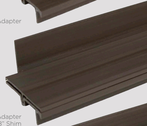
Direct Glaze Adapter with 1/8" Shim