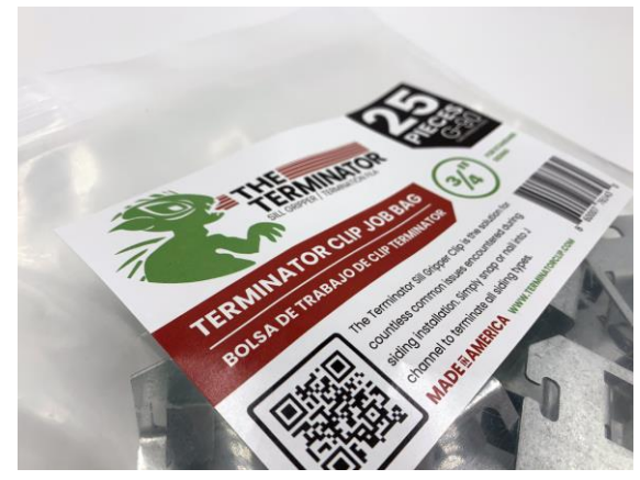
25 CT Job Bag. For HOA or other projects where inventory control is essential.