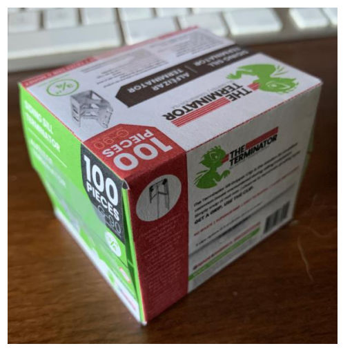
The big one...100CT Job Box. This box has enough clips to replace 25 pieces of Utility Trim. Perfect for the average 30SQ vinyl siding project. Our number one seller!