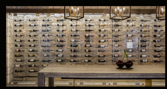
WINE PEG SERIES