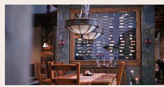
SHOWCASE SERIES starting at $127