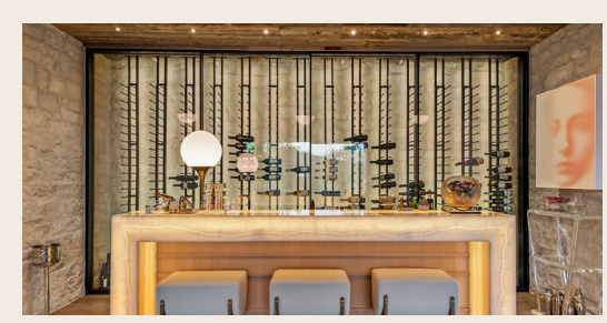
FTC SERIES starting at $608