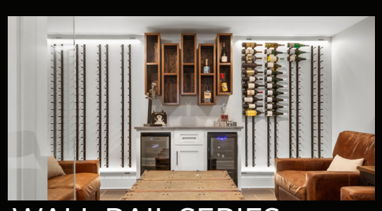
WALL RAIL SERIES