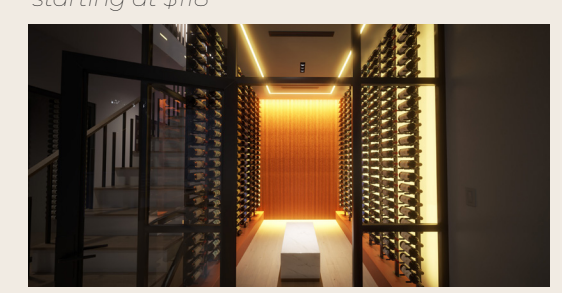
MINIMALIST SERIES starting at $709