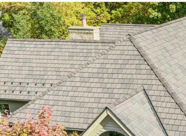
Niagara Shake in Custom Blend