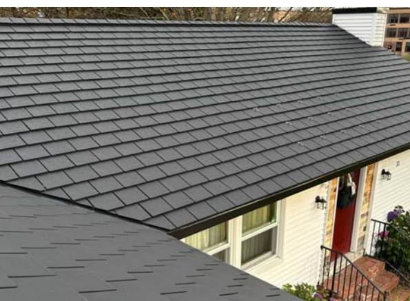
Concrete Flat Tile in Black