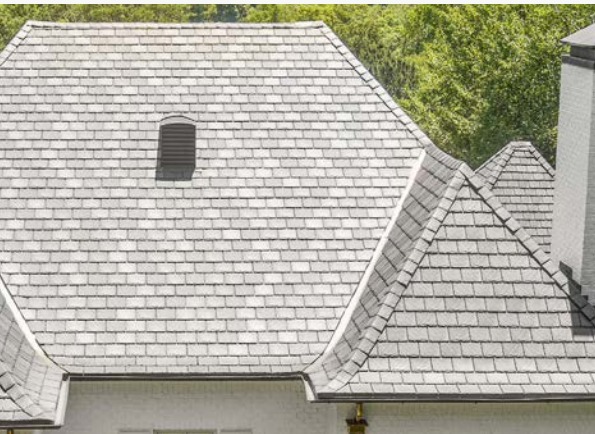
Niagara Slate in Stormy Gray Blend