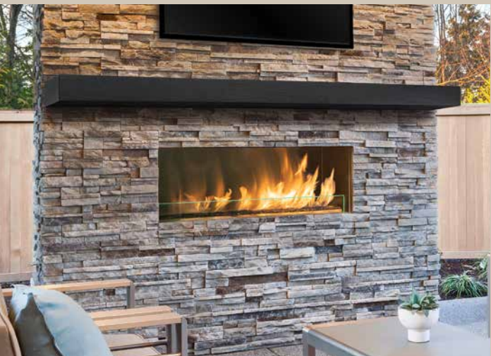
Linear Shelf shown in Onyx Finish