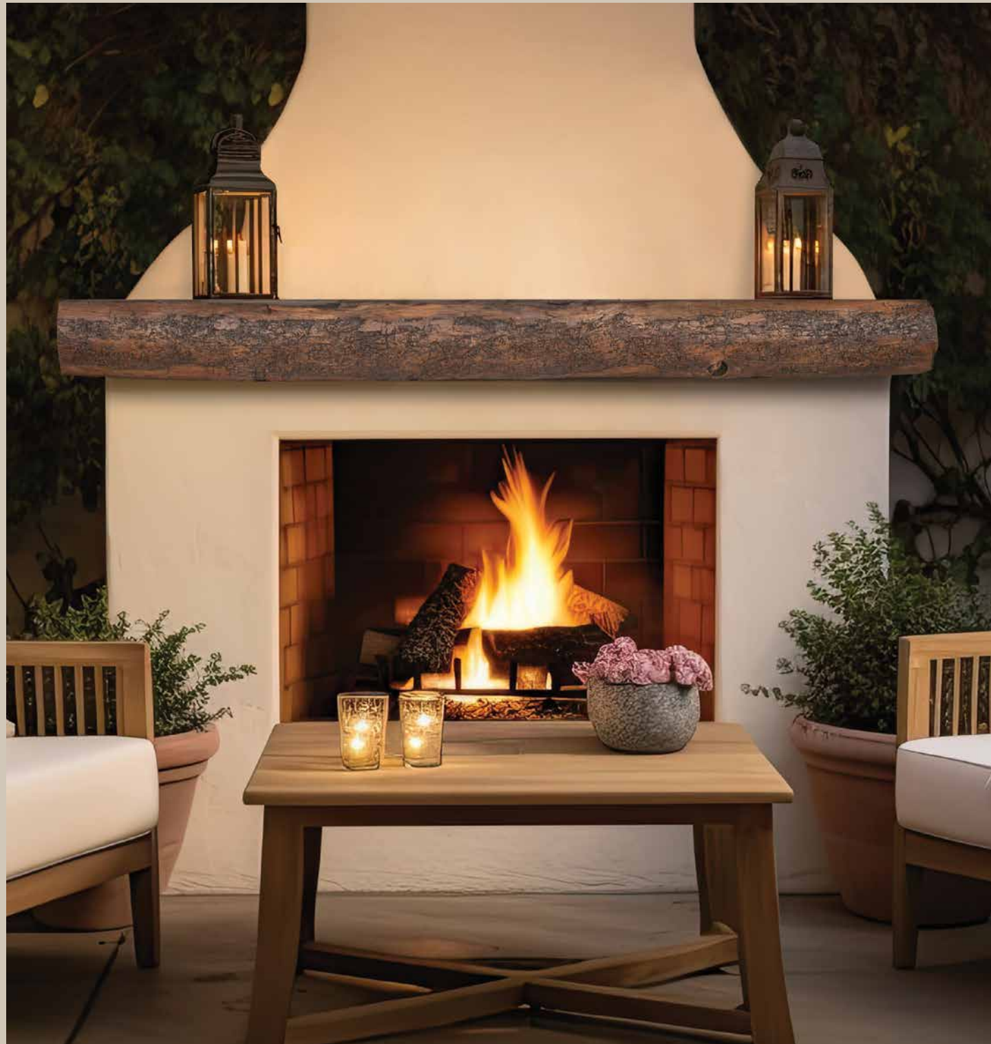
Shown in Toasted Rye Finish