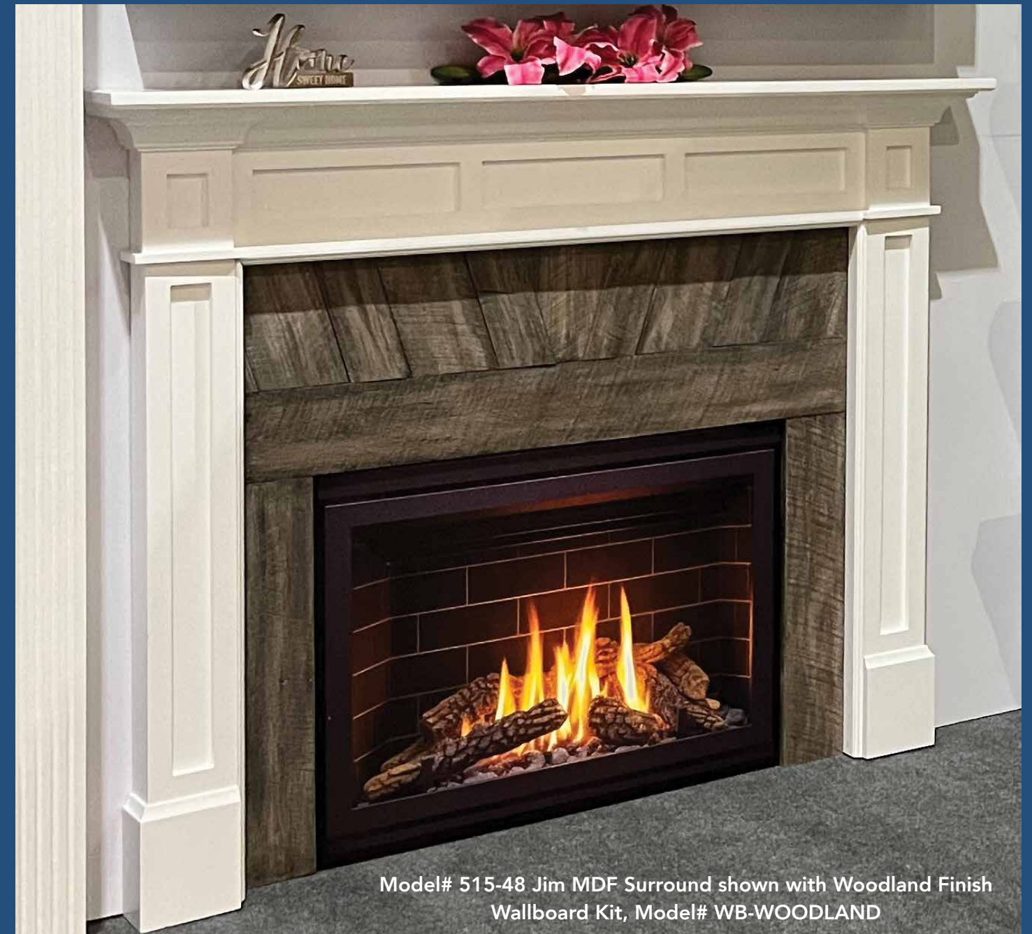
Model# 515-48 Jim MDF Surround shown with Woodland Finish Wallboard Kit, Model# WB-WOODLAND

Boards may be cut with a tile saw, angle grinder, or other common masonry cutting tools. Install using a high heat safe construction adhesive or other commonly used masonry adhesives.