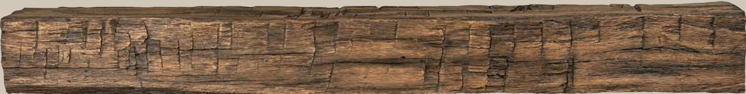
FIELDSTONE FINISH: 72” MODEL NCT-72FS AND 60” MODEL NCT-60FS

ALL MODELS SHOWN IN 72” LENGTH. THE 60” LENGTH IS MADE FROM THE SAME UNIQUE MOLD AS THE 72” AND WILL VARY SLIGHTLY IN APPEARANCE. PLEASE VISIT OUR WEBSITE WWW.PEARLMANTELS.COM