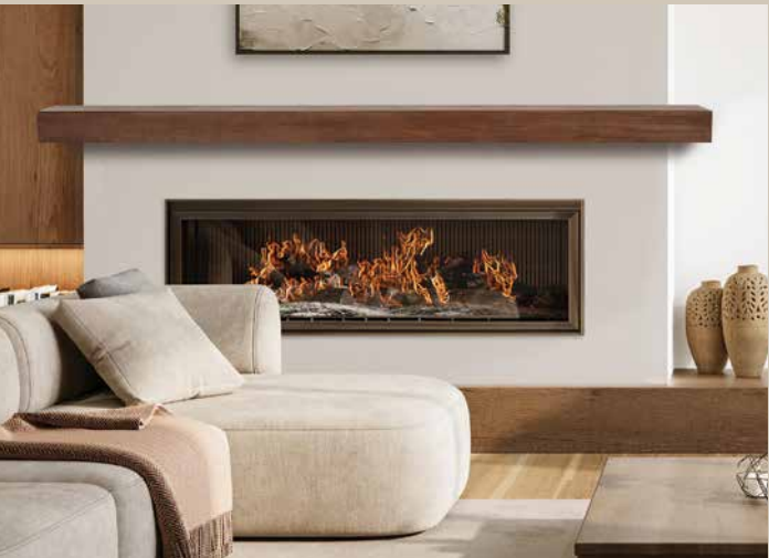
Linear Shelf shown in Saddle Finish

HEAT CLEARANCES - For safety precautions, regardless of which Wood, MDF, Cast Stone or Non-Combustible Pearl Mantels product you are mounting, follow heat clearances as stated by local building codes and the manufacturer of your fireplace insert or stove for COMBUSTIBLE shelves and surrounds. Please choose carefully as all of our Inspiration products are custom made and may not be returned or cancelled.