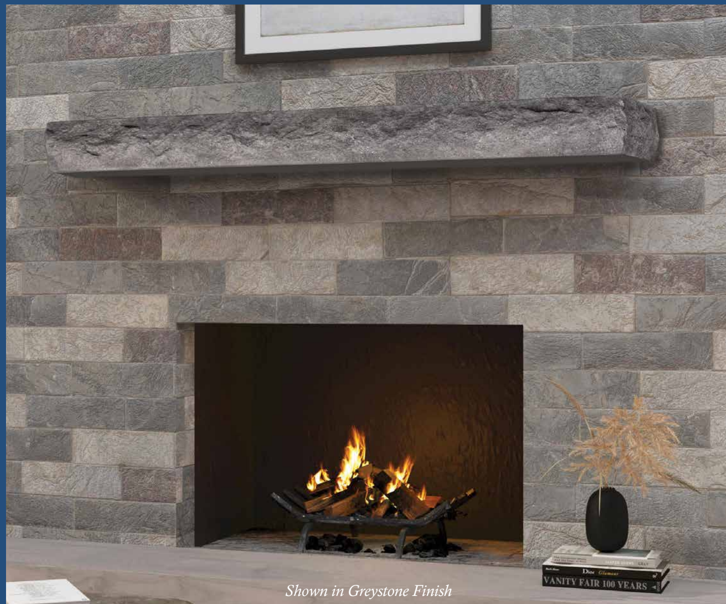
Shown in Greystone Finish