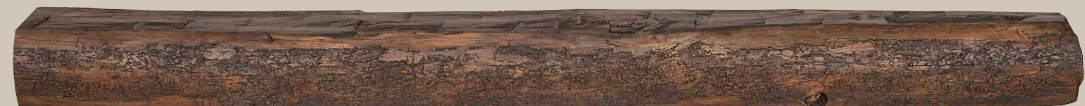
TOASTED RYE FINISH: 72" MODEL NCC-72TR AND 60" MODEL NCC-60TR