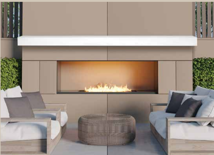
Linear Shelf shown in Pearl Finish