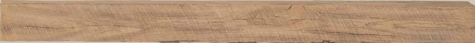
WHEAT FINISH: 72" MODEL NCNR-72W AND 60" MODEL NCNR-60W