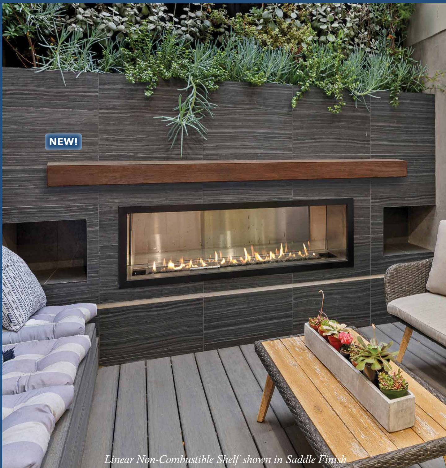
Linear Non-Combustible Shelf shown in Saddle Finish

Visit our website for more photos and information on our products and fine furniture quality finishes www.pearlmantels.com