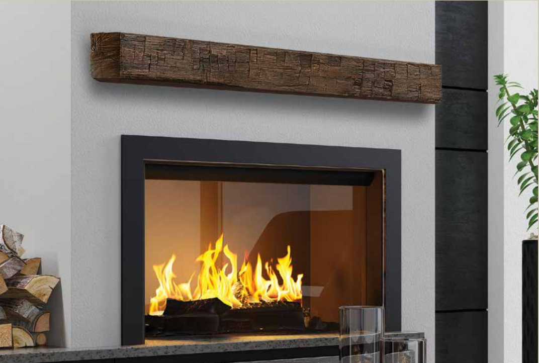
THE TAVERN Shown in Toasted Rye Finish

What makes these mantels so special? They are (ASTM E136) non-combustible replicas of actual pieces of wood and stone formed or naturally patinaed by Mother Nature’s magical beauty. Our subjects were found in rock quarries, barns and forests. Each model is completely unique to Pearl Mantels and will not be found or seen anywhere else in the market.