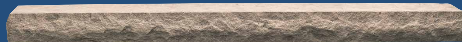
MIST FINISH: 72" MODEL NCCS-72M AND 60" MODEL NCCS-60M

HEAT CLEARANCES - For safety precautions, regardless of which Wood, MDF, Cast Stone or Non-Combustible Pearl Mantels product you are mounting, follow heat clearances as stated by local building codes and the manufacturer of your fireplace insert or stove for COMBUSTIBLE shelves and surrounds. Please choose carefully as all of our Inspiration products are custom made and may not be returned or cancelled.