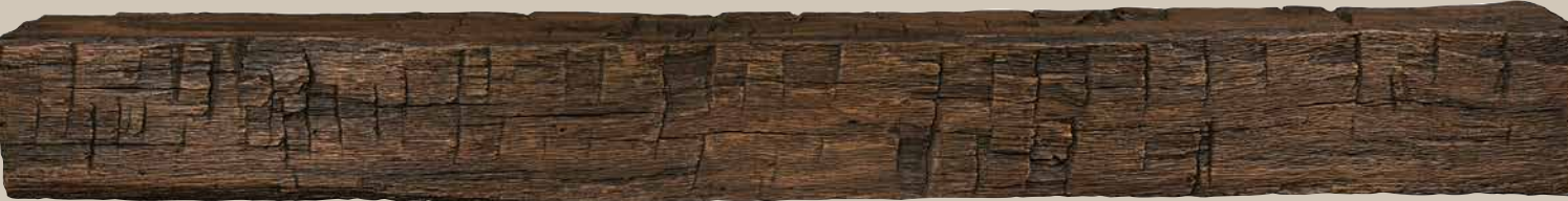
TOASTED RYE FINISH: 72” MODEL NCT-72TR AND 60” MODEL NCT-60TR