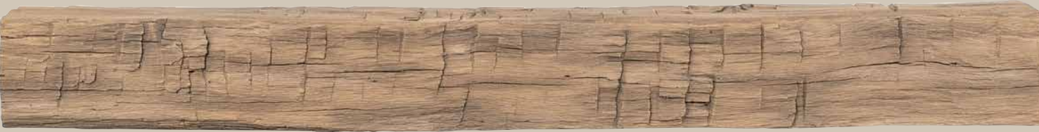
WHEAT FINISH: MODEL NCT-72W AND 60” MODEL NCT-60W

HEAT CLEARANCES - For safety precautions, regardless of which Wood, MDF, Cast Stone or Non-Combustible Pearl Mantels product you are mounting, follow heat clearances as stated by local building codes and the manufacturer of your fireplace insert or stove for COMBUSTIBLE shelves and surrounds. Please choose carefully as all of our Inspiration products are custom made and may not be returned or cancelled. Visit our website for more photos and information on our products and fine furniture quality finishes— www.pearlmantels.com Actual finish colors may vary from photos. © 1995-2025 Pearl Mantels Corporation®