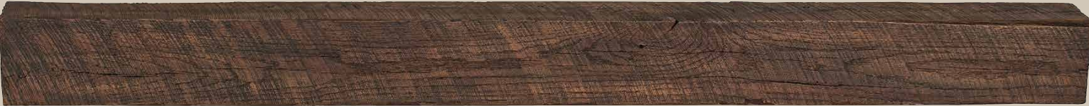
TOASTED RYE FINISH: 72" MODEL NCNR-72TR AND 60" MODEL NCNR-60TR