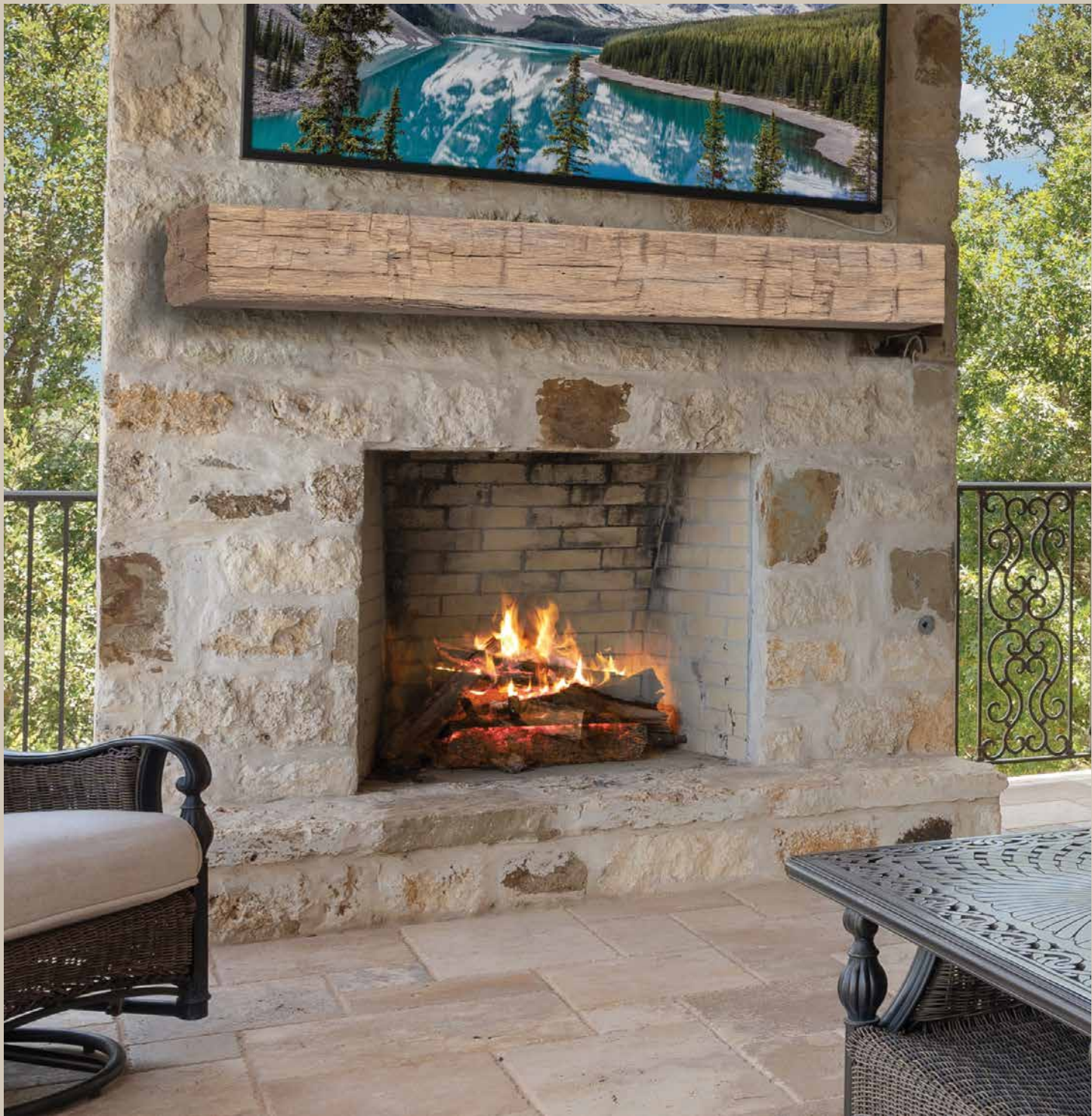
Shown in Wheat Finish

For use indoors or out, this ASTM E136 non-combustible mantel shelf exudes artisanal charm.