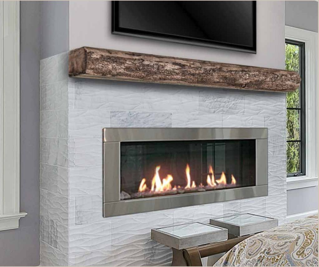
THE CUMBERLAND Shown in River Rock Finish

“There’s nothing as warm and welcoming as a crackling fire in an open fireplace...”