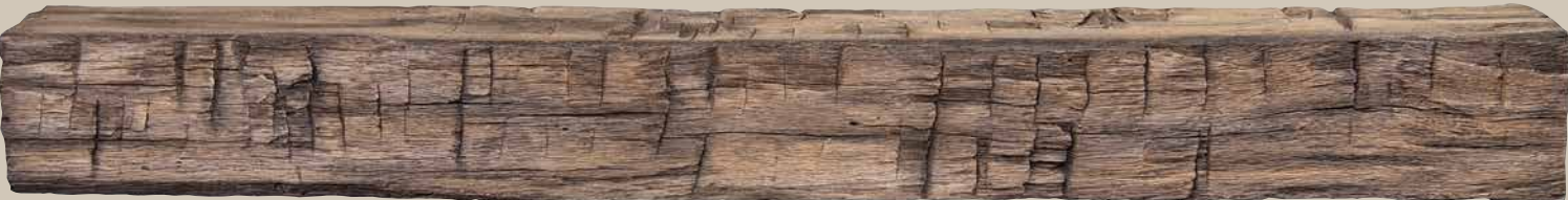
RIVER ROCK FINISH: 72” MODEL NCT-72RR AND 60” MODEL NCT-60RR