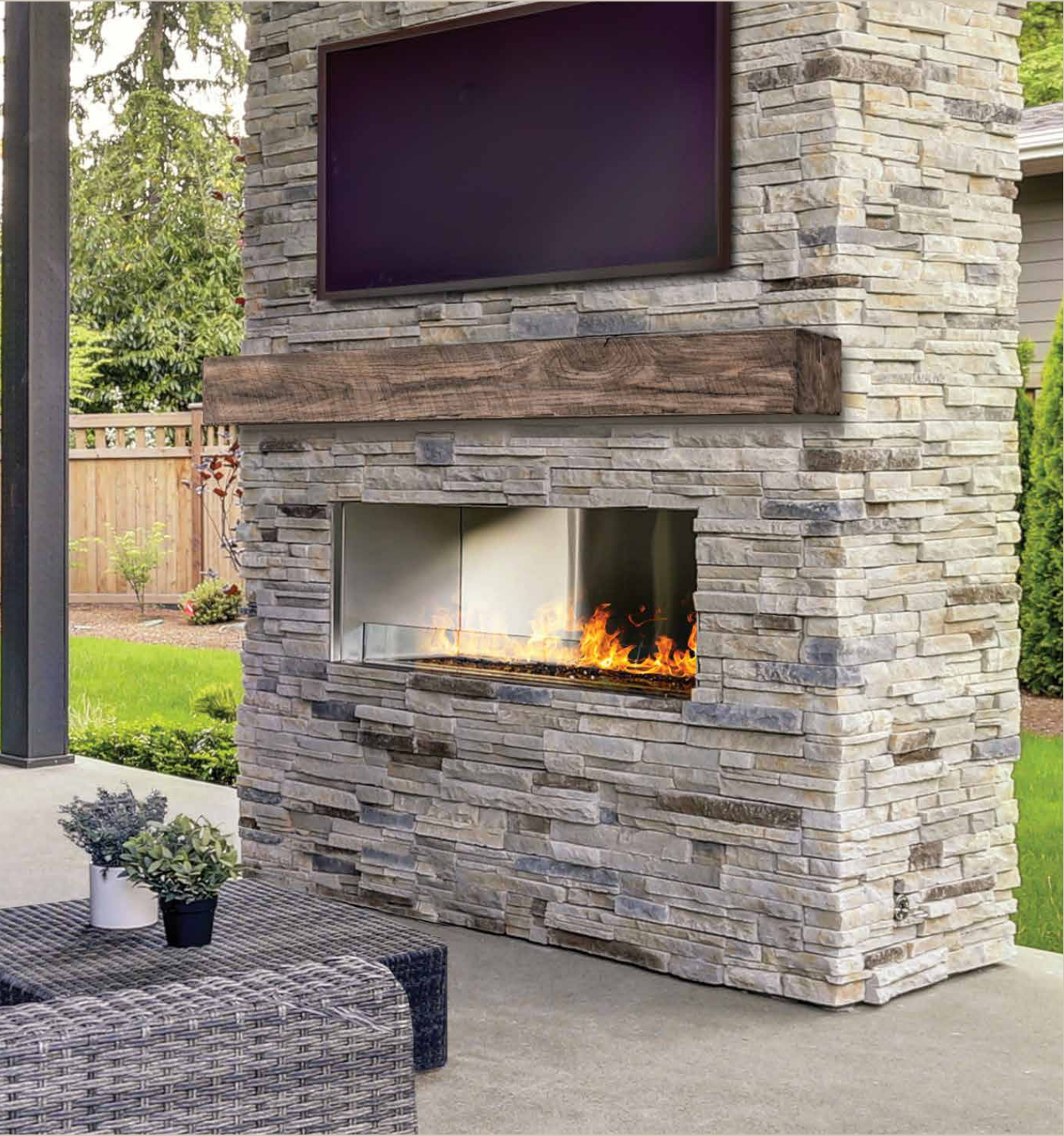
Shown in River Rock Finish

For use indoors or out, this ASTM E136 non-combustible mantel shelf was fashioned from a White Oak barn wood beam.