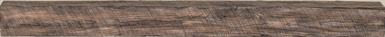
RIVER ROCK FINISH: 72" MODEL NCNR-72RR AND 60" MODEL NCNR-60RR