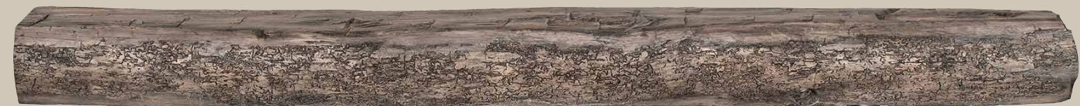
RIVER ROCK FINISH: 72" MODEL NCC-72RR AND 60" MODEL NCC-60RR