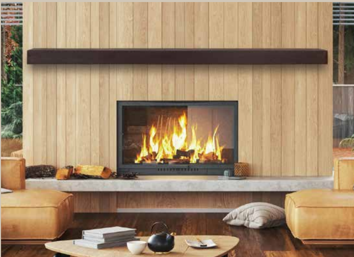
Linear Shelf shown in Mocha Finish