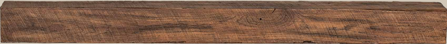
FIELDSTONE FINISH: 72" MODEL NCNR-72FS AND 60" MODEL NCNR-60FS

ALL MODELS SHOWN IN 72" LENGTH. THE 60" LENGTH IS MADE FROM THE SAME UNIQUE MOLD AS THE 72" AND WILL VARY SLIGHTLY IN APPEARANCE. PLEASE VISIT OUR WEBSITE WWW.PEARLMANTELS.COM