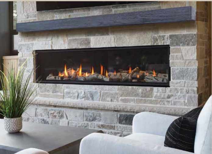
Linear Shelf shown in Graphite Finish