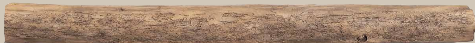
WHEAT FINISH: 72" MODEL NCC-72W AND 60" MODEL NCC-60W

HEAT CLEARANCES - For safety precautions, regardless of which Wood, MDF, Cast Stone or Non-Combustible Pearl Mantels product you are mounting, follow heat clearances as stated by local building codes and the manufacturer of your fireplace insert or stove for COMBUSTIBLE shelves and surrounds. Please choose carefully as all of our Inspiration products are custom made and may not be returned or cancelled.