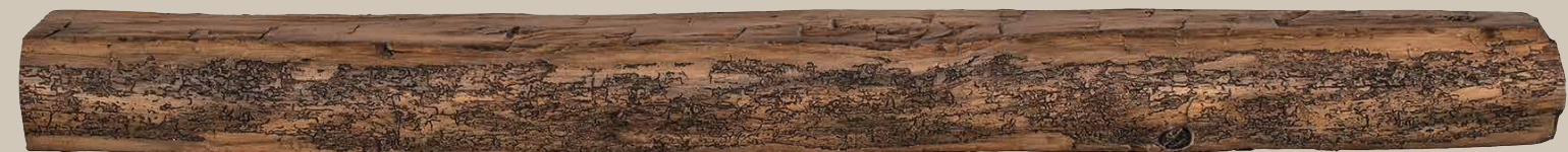
FIELDSTONE FINISH: 72" MODEL NCC-72FS AND 60" MODEL NCC-60FS

ALL MODELS SHOWN IN 72" LENGTH. THE 60" LENGTH IS MADE FROM THE SAME UNIQUE MOLD AS THE 72" AND WILL VARY SLIGHTLY IN APPEARANCE. PLEASE VISIT OUR WEBSITE WWW.PEARLMANTELS.COM