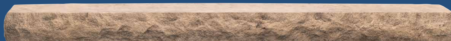
DUSK FINISH: 72" MODEL NCCS-72D AND 60" MODEL NCCS-60D