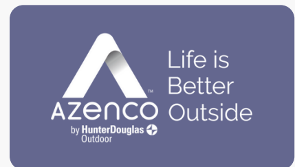
Logo & Brand Guidelines