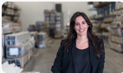
Our People and Factory