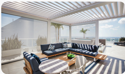
All High Resolution Images