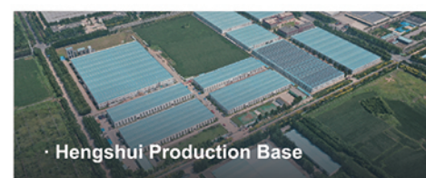
· Hengshui Production Base