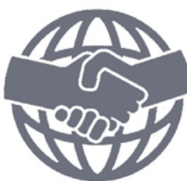
Bulk Trade International