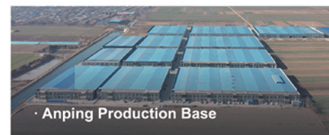
· Anping Production Base