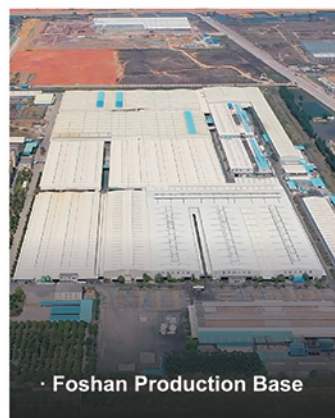
· Foshan Production Base

Yanyi International has three production bases in Anping, Hengshui (both in Hebei Province), and Foshan (Guangdong Province), with a total area exceeding 80,000 square meters and over a thousand employees, producing over 100,000 square meters of glass and windows and doors per month. It deeply roots in China while connecting the world.