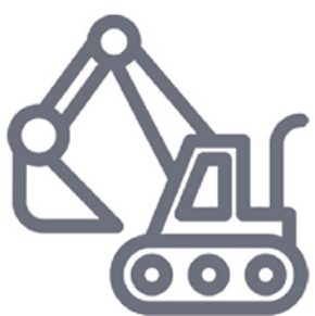
Building Materials Export

Yanyi International Business, serves as the core platform for Yanyi Group's global marketing, trade, and investment initiatives. The company specializes in several key sectors, including the building materials export sector, international supply chain sector, international consulting and investment sector, and bulk trade sector.