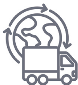
International Supply Chain