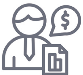
International Consulting and Investment