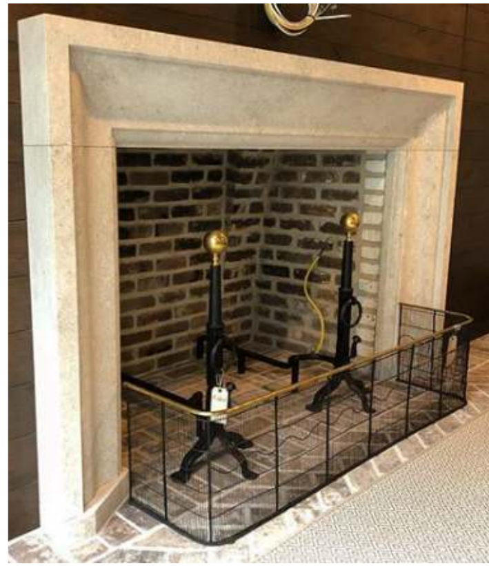
RESIDENTIAL | FIREPLACES