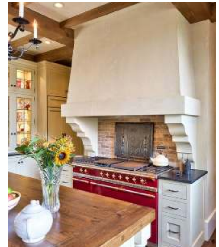
RESIDENTIAL | KITCHEN HOODS