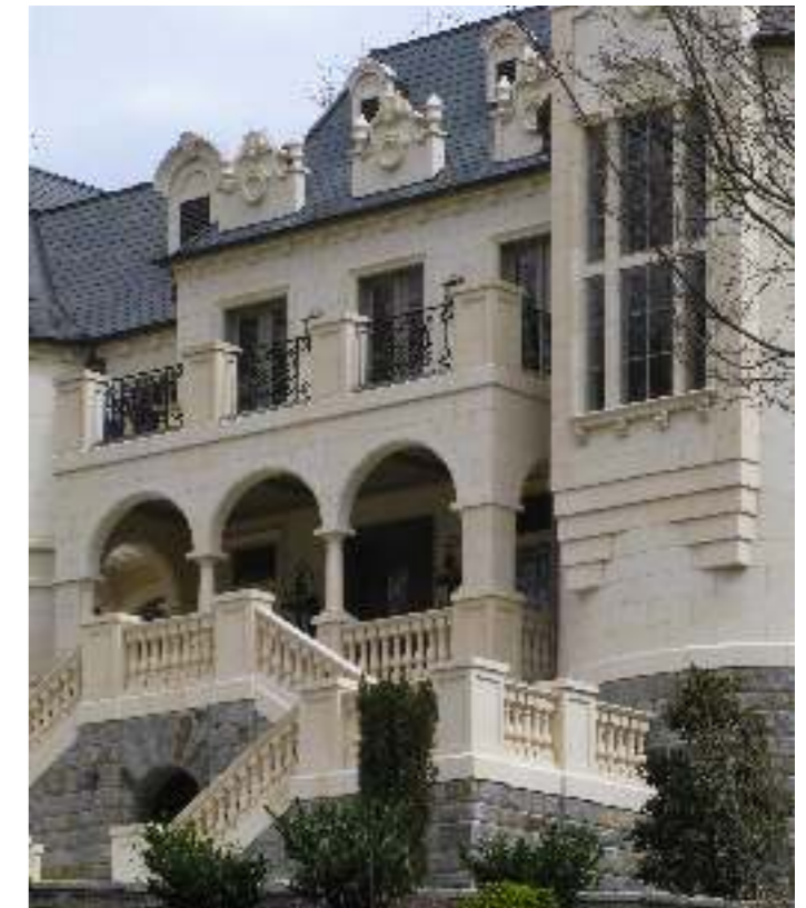
FEATURED PROJECT | FRENCH INSPIRED CHATEAU | ASHEVILLE, NC