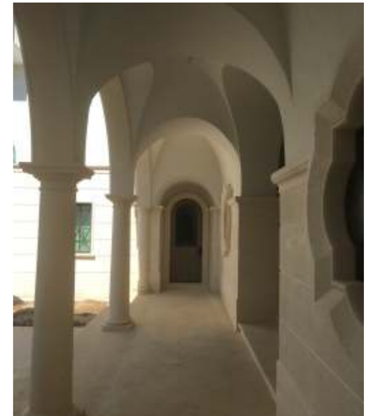
FEATURED PROJECT | MEDITERRANEAN VILLA | SEA ISLAND, GA