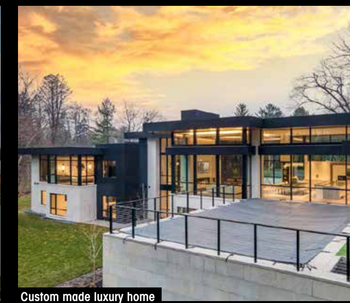
Custom made luxury home