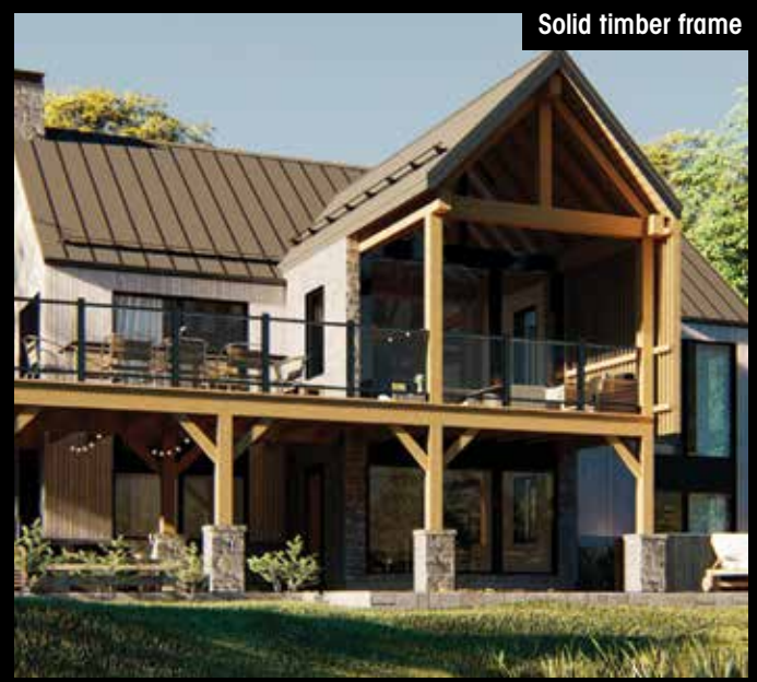
Solid timber frame