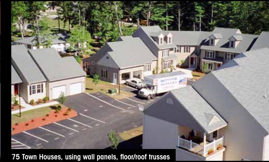
75 Town Houses, using wall panels, floor/roof trusses