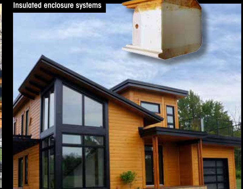
Insulated enclosure systems