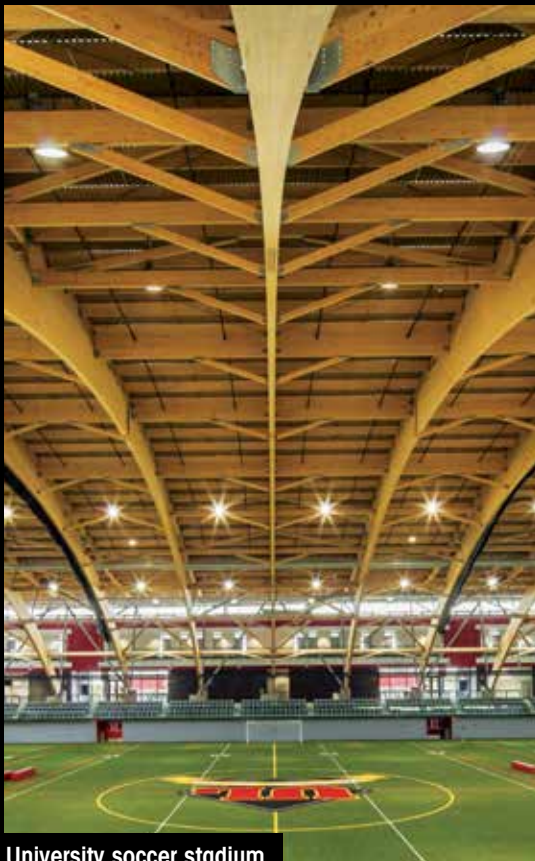
University soccer stadium