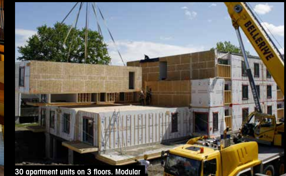
30 apartment units on 3 floors. Modular