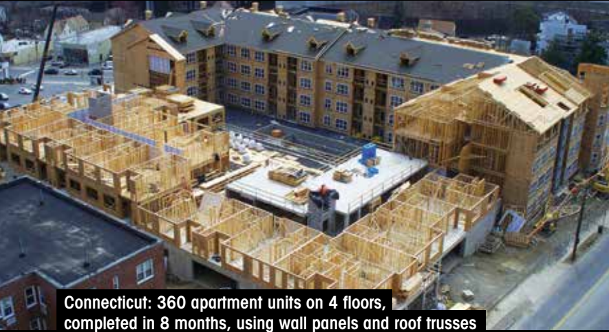
Connecticut: 360 apartment units on 4 floors, completed in 8 months, using wall panels and roof trusses