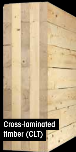
Cross-laminated timber (CLT)