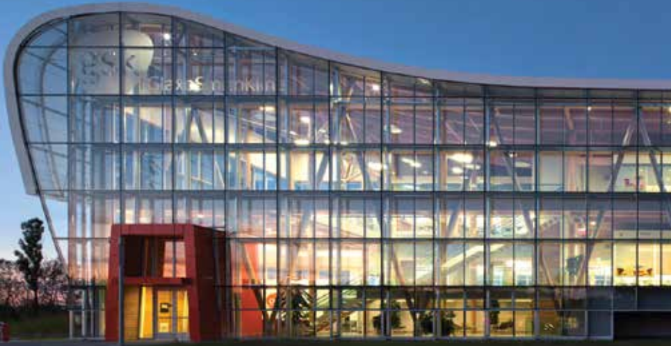
GSK offices. National award: Innovation in architecture