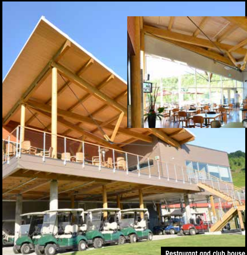
Restaurant and club house