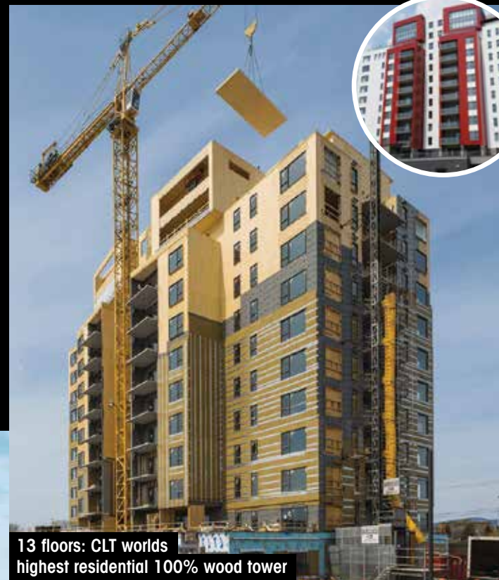
13 floors: CLT worlds highest residential 100% wood tower