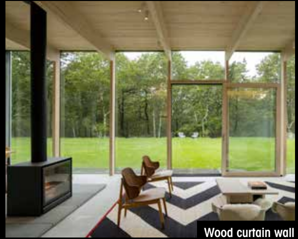
Wood curtain wall