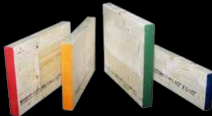
Laminated finger-jointed lumbers (LFL) for structural use in rafters, headers, tall studs, rim boards, joists and trusses