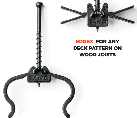
EDGE ® FOR ANY DECK PATTERN ON WOOD JOISTS

CAMO Universal Deck Clips are backed by a CAMO Warranty for use with leading grooved deck boards. Read the full warranty at camofasteners.com