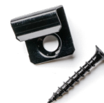
STARTER FOR THE FIRST BOARD