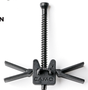
EDGEXMETAL ® FOR ANY DECK PATTERN ON 14-18GA METAL JOISTS