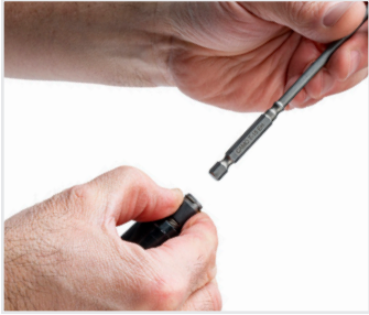
LOAD THE INCLUDED T-15 BIT.