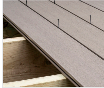
PLACE BOARDS AND CLIPS.