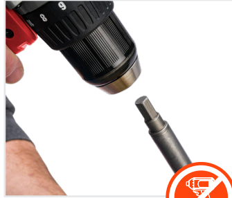
ATTACH TO YOUR DRILL.