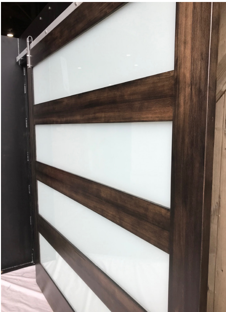
Monster Door® 7404

Shown in red oak with factory finish (weathered with gray finish)