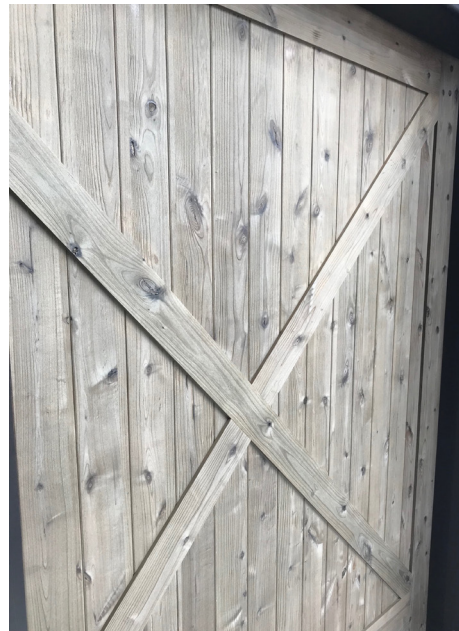
Monster Door® 49853

Shown in hemlock with white laminate glass