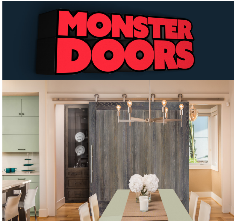
Monster Door® 49801

Shown in red oak with factory finish (weathered with gray finish)