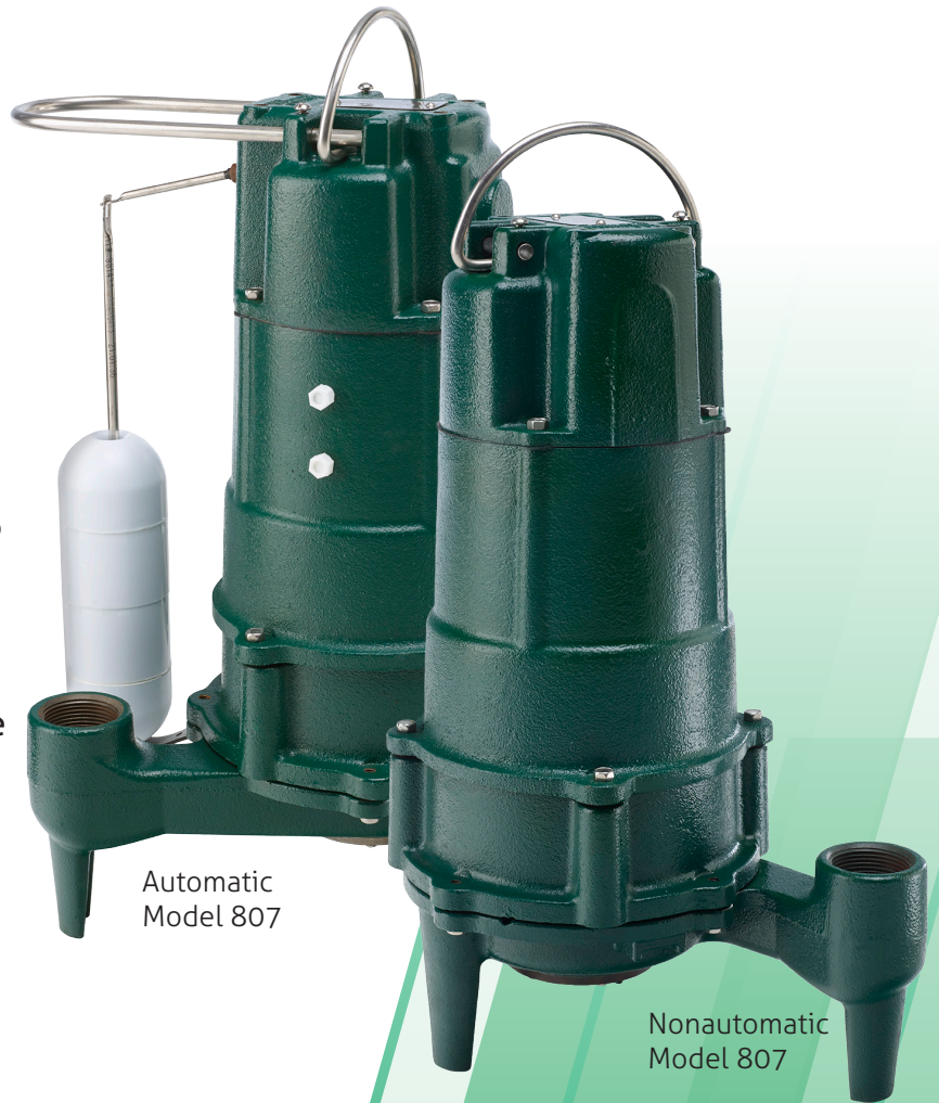
Automatic Model 807

FM2882 Technical Data Sheet FM2903 Installation Instructions