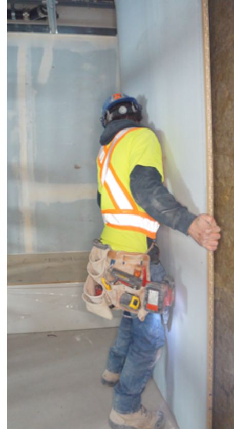
Drywall contractor lining up QuietRock CLD panel for installation.

QuietRock® by PABCO® Gypsum, the first and most technically advanced sound reducing drywall, was developed in 2003 using modern chemistries, techniques and a Silicon Valley approach to building science. Through continued innovation, including the patented EZ-Snap® Technology, QuietRock® Sound Reducing Drywall is a cost effective alternative to conventional approaches for building acoustically rated walls.