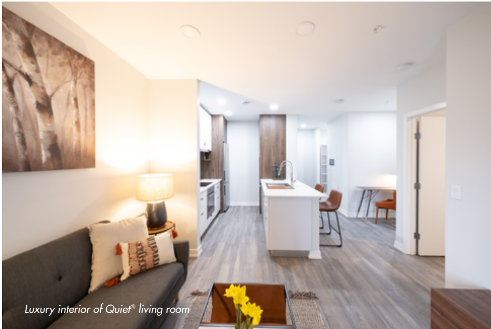
Luxury interior of Quiet® living room