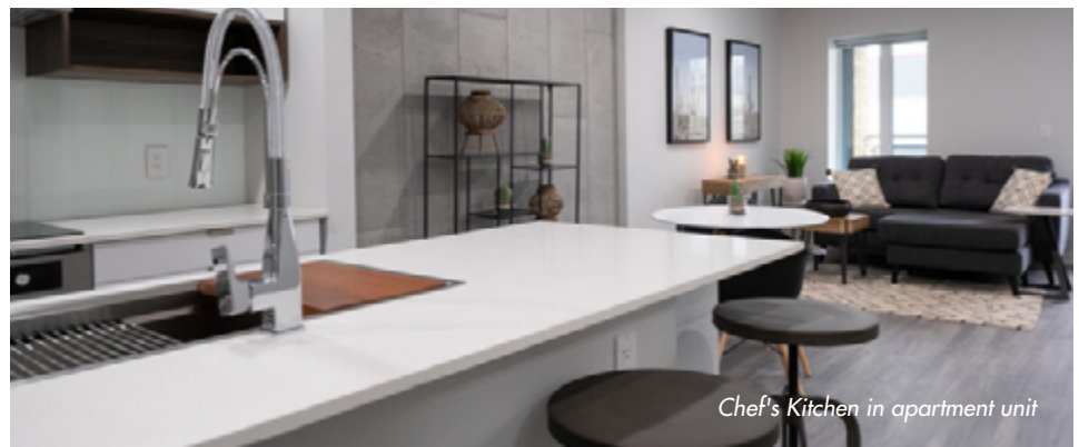
Chef's Kitchen in apartment unit

With Kanas' innovative approach to construction, including its use of QuietRock, they were able to achieve an environmentally sustainable property over the long term, a key objective for the Orion property. This longevity goal extended to the use of durable materials that could stand the test of time, including granite or quartz countertops in each of the apartments.