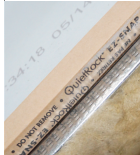
QuietRock EZ-SNAP Mold Resistant panel installed on steel framing.