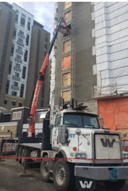
Pacific West Supply delivering QuietRock® for the project.