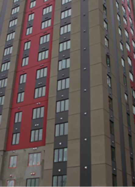
Orion at Lumino Park exterior.