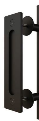
8-1/2" Flat Pull w/ 12" Round Bar Pull Set 68011 19 & 32D