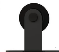
Top Mount Hanger 69952 15 & 19