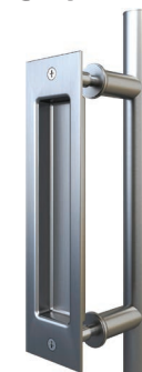
8" Flush / 10" Bar Pull Set 68005 19 & 32D