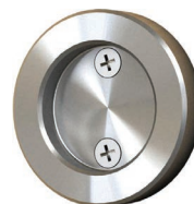
2-1/8" Round Pull 68006 10B, 19, & 32D