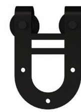
Horseshoe Hanger 69953 10B