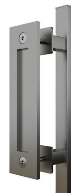
8-1/2" Flat Pull w/ 12" Square Bar Pull Set 68012 19 & 32D