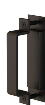
6-1/2" Flush / Barn Pull Set 68007 19 & 32D