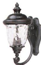
Carriage House DC 3423WGOB