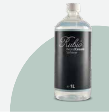
Please reference the TDS before using

Rubio® WoodCream Softener is a product that allows you to decrease the color intensity of the Rubio® WoodCream colors and create a more transparent or aged effect. Rubio® WoodCream Softener is also used as a mix-in when performing a maintenance application of Rubio® WoodCream.