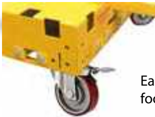
Each wheel has a foot pedal break

The small footprint and huge carrying capacity of the Rack and Roll Safety Dolly is designed as a substrate carrier in the sign industry. Multiple types of sheet and/or rolled substrates can be carried simultaneously.