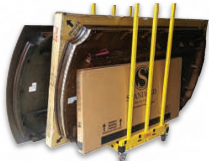
Raised red 4" locking casters