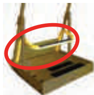
Foot Leverage Bar