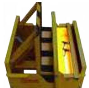
Option: Storage Box Store tools & straps.