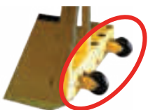
Dock Transition Wheels