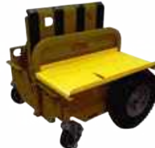
Option: Pivoting Shelf Carry an extra 14 sheets!