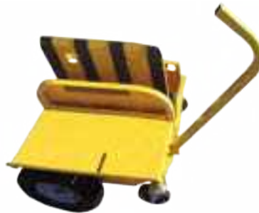
Convenient Handle For moving when empty.