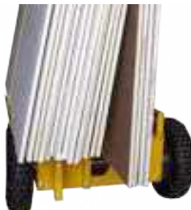
18 sheet capacity with optional shelf.