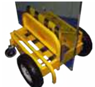
Rubber-lined brace to protect substrate.