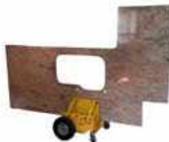
Able to hold a 700lb. granite slab.