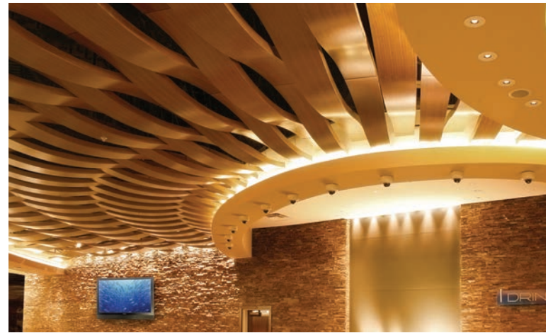
Rulon's high-end, quality wood ceiling and wall products have allowed architects and designers to flex their creative muscles.

business and provide for his family. It was 1985 when Rulon branched out into the architectural world with the introduction of our flagship product, Linear Open Suspended Wood Ceiling System, which was first installed at the Marriott Marquis Hotel Theatre on Broadway in New York City. This beautiful high-quality wood ceiling system quickly became very popular, and remains so today. It helped set the tone and pave the way for the rapid growth for Rulon. Rulon continued high-end product development with Aluratone acoustical wood ceilings and walls and Curvalon curved and radiused wood ceiling and wall systems. Another key to success was the decision to employ salaried sales team members instead of independent representatives or distributors. The sales team consists of technically trained experts on all Rulon products and are not distracted by multiple lines of competing products.