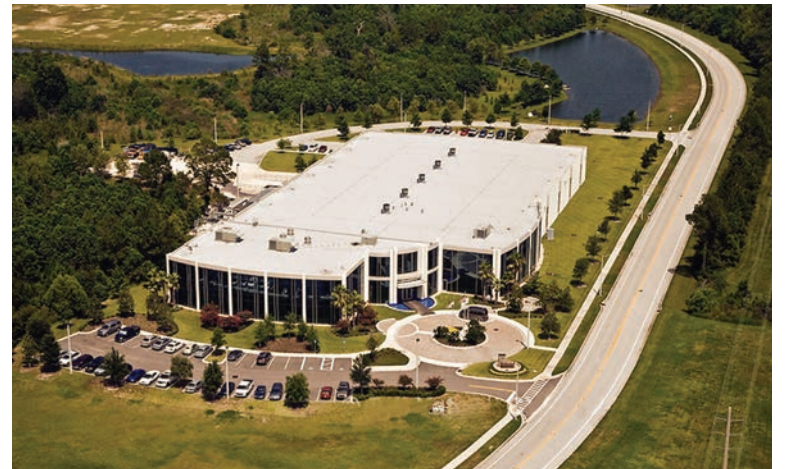
Rulon International's corporate office and green, state-of-the-art manufacturing plant in St. Augustine, Florida.

Rulon to be nearly waste-free. The sawdust and scraps generated during manufacturing are collected into special collection trailers and donated to local businesses that use them as biofuel for their operations. High-efficiency and low-energy lighting was also added to allow Rulon to operate with a low carbon footprint. The new corporate office and manufacturing facility allows Rulon to introduce new innovative products of wood ceiling and acoustical wood wall systems. The new building, growth of a dedicated sales team, in-house engineers and staff architects all continue to pave the way for Rulon's success and growth. But one question still remains: Could it make a difference in someone's life?