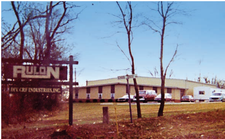
Rulon International was started in the suburbs of Philadelphia in the 1970's and operated from a small building in Souderton, Pennsylvania.