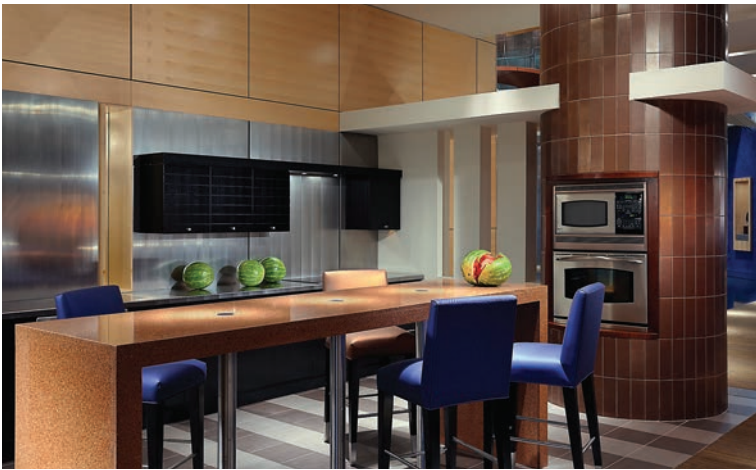
Rulon's office interior allows employees to work in comfort while displaying real working products for visiting customers.