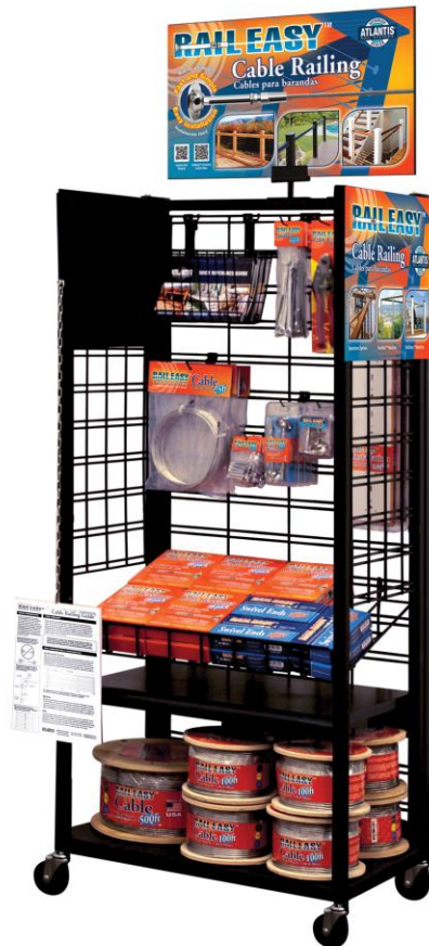
RailEasy™ Point-of-Purchase Display