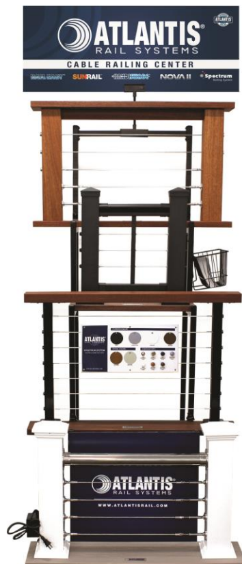
Cable Railing Center